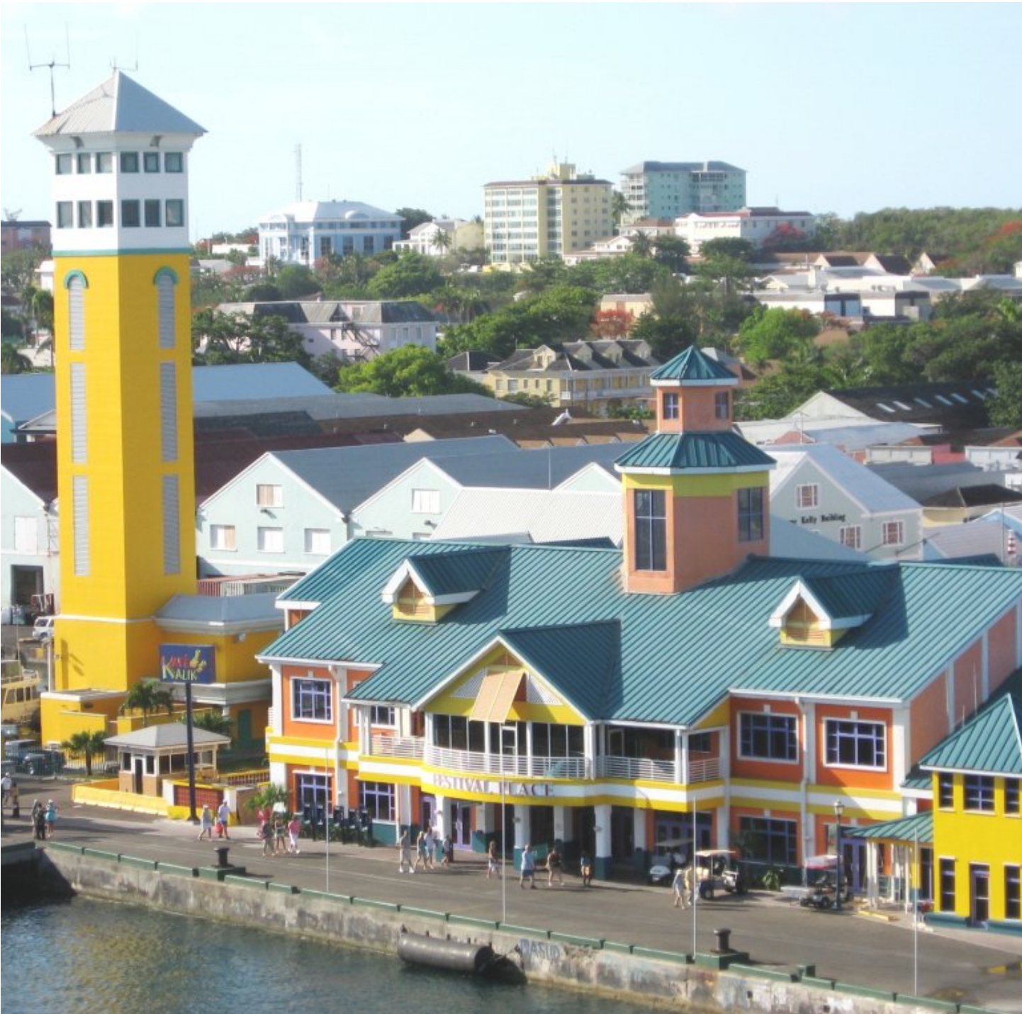
Port of Nassau