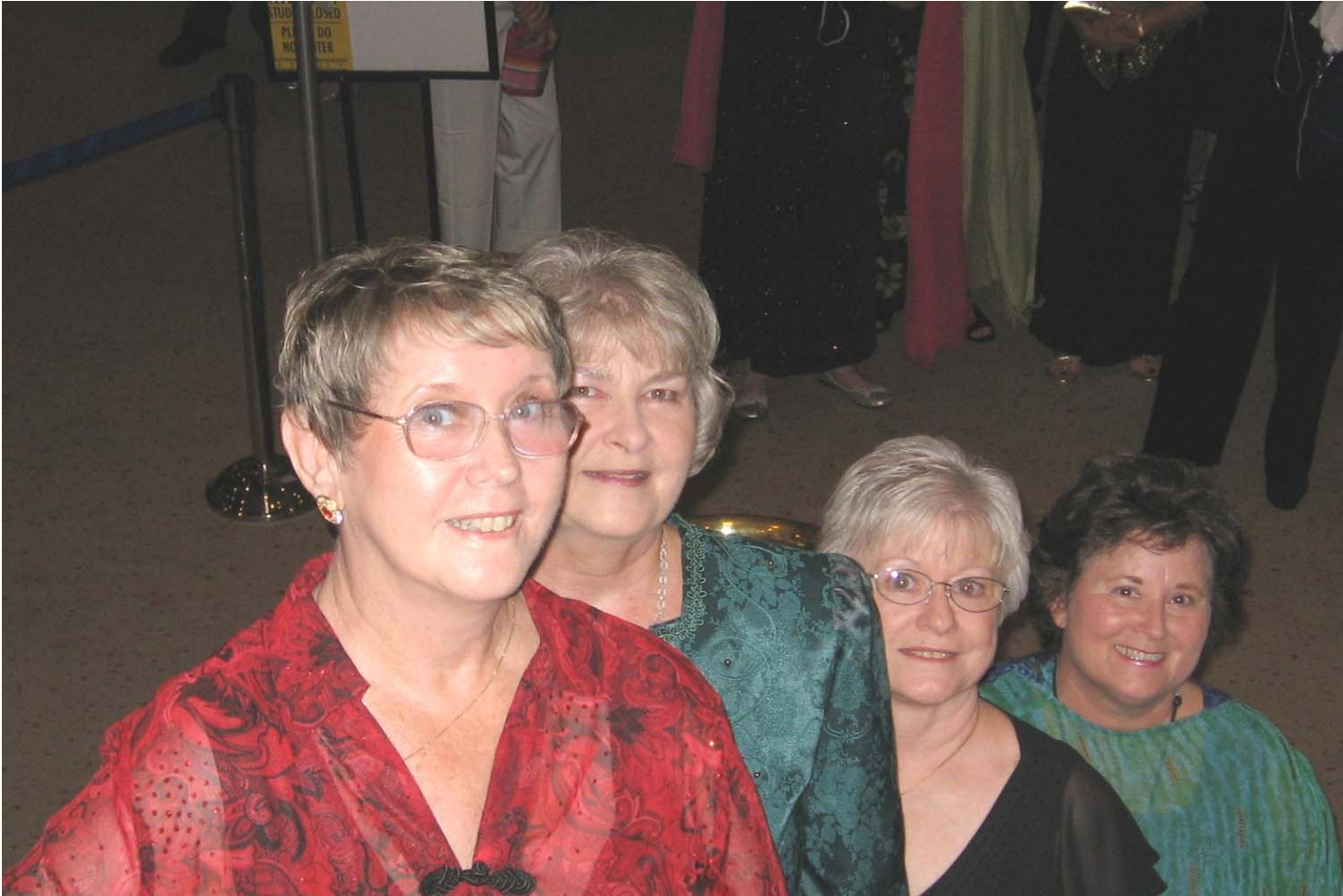
Class of 1964